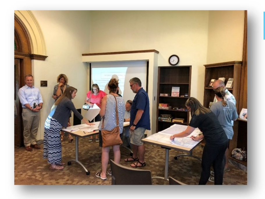
Defiance Public Meeting on August 1, 2019

"Look at existing trails we have and explore more ways to <u>connect</u> them all."