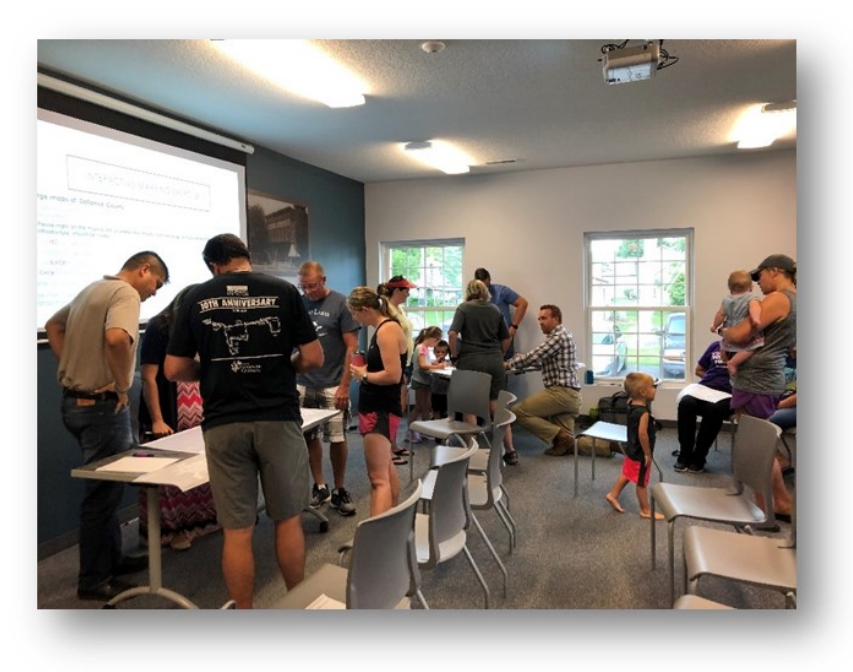
Hicksville Public Meeting on July 30, 2019

After a brief presentation by Maumee Valley Planning Organization on the survey results and the plan development, participants were asked to draw on maps where they wanted to see sidewalks, bike lanes, trails, and connections in Defiance County and throughout the municipalities. Public comments were also collected during the meetings, with input on where to place bicycle and pedestrian infrastructure and where to make improvements.